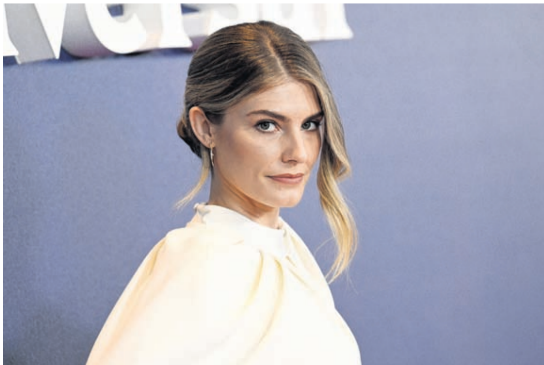
Caitlin Bassett attends NBCUniversal's 2022 Upfront press junket in New York on May 16, 2022. Bassett stars in the NBC series "Quantum Leap."

The new "Quantum Leap" takes place decades after the sci-fi classic left off. The first version starred Scott Bakula as a scientist who leapt between various bodies to help people solve a dilemma. In the se-